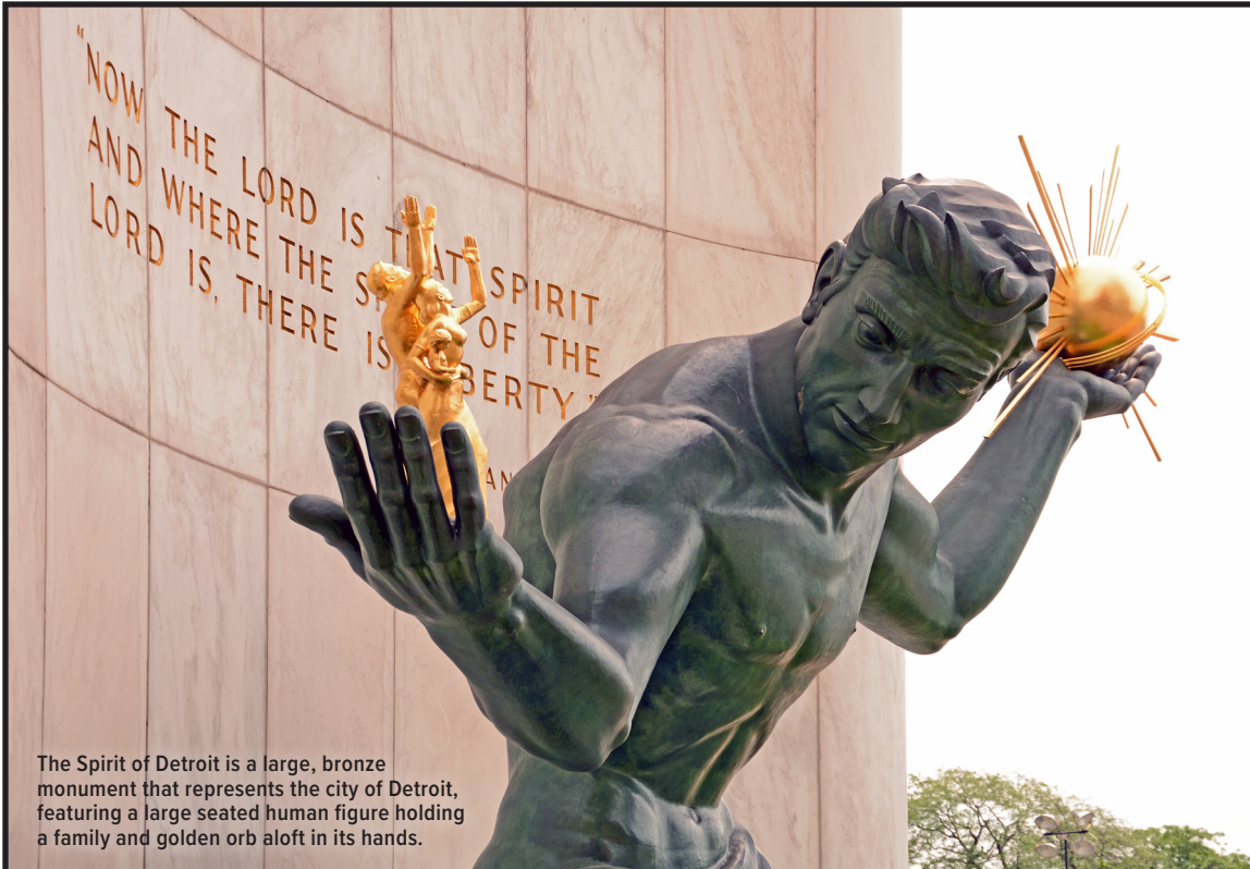
The Spirit of Detroit is a large, bronze monument that represents the city of Detroit, featuring a large seated human figure holding a family and golden orb aloft in its hands.